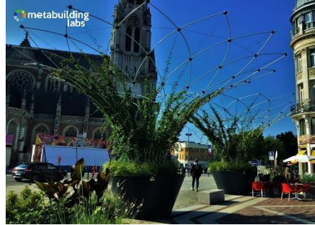
The IMMERSITE® 3D visualization table and vegetal Corolla tree will be showcased

Another focus will be put on an instant tree offering a Nature-Based Solution for the public space to fight heat islands in cities.