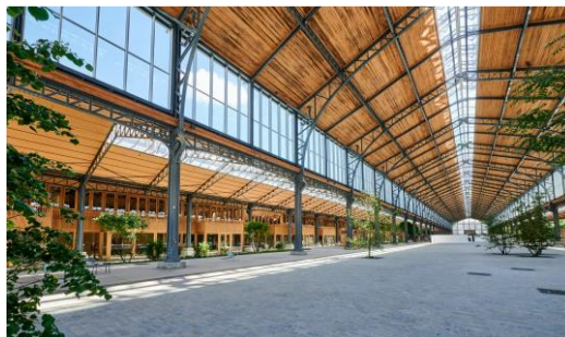
The Fixed Fair will take place at Gare Maritime